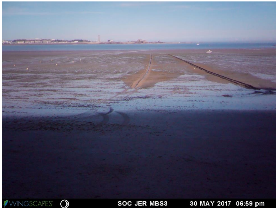
Day One (just ploughed)