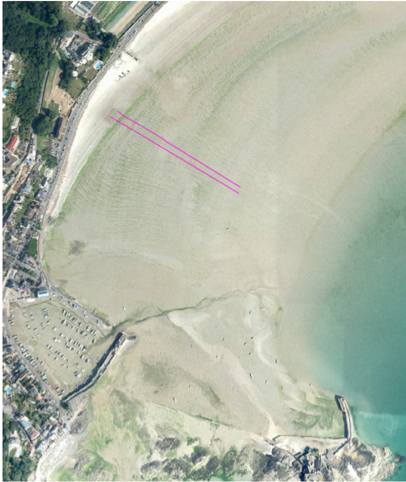
The exact position of the two furrows on an aerial photo, as plotted using a GPS unit.