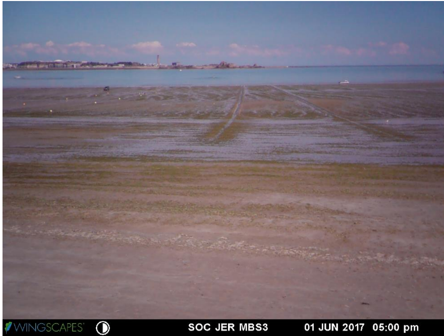
Day Three (48 hours)