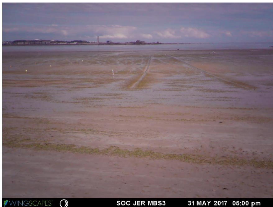
Day Two (24 hours)